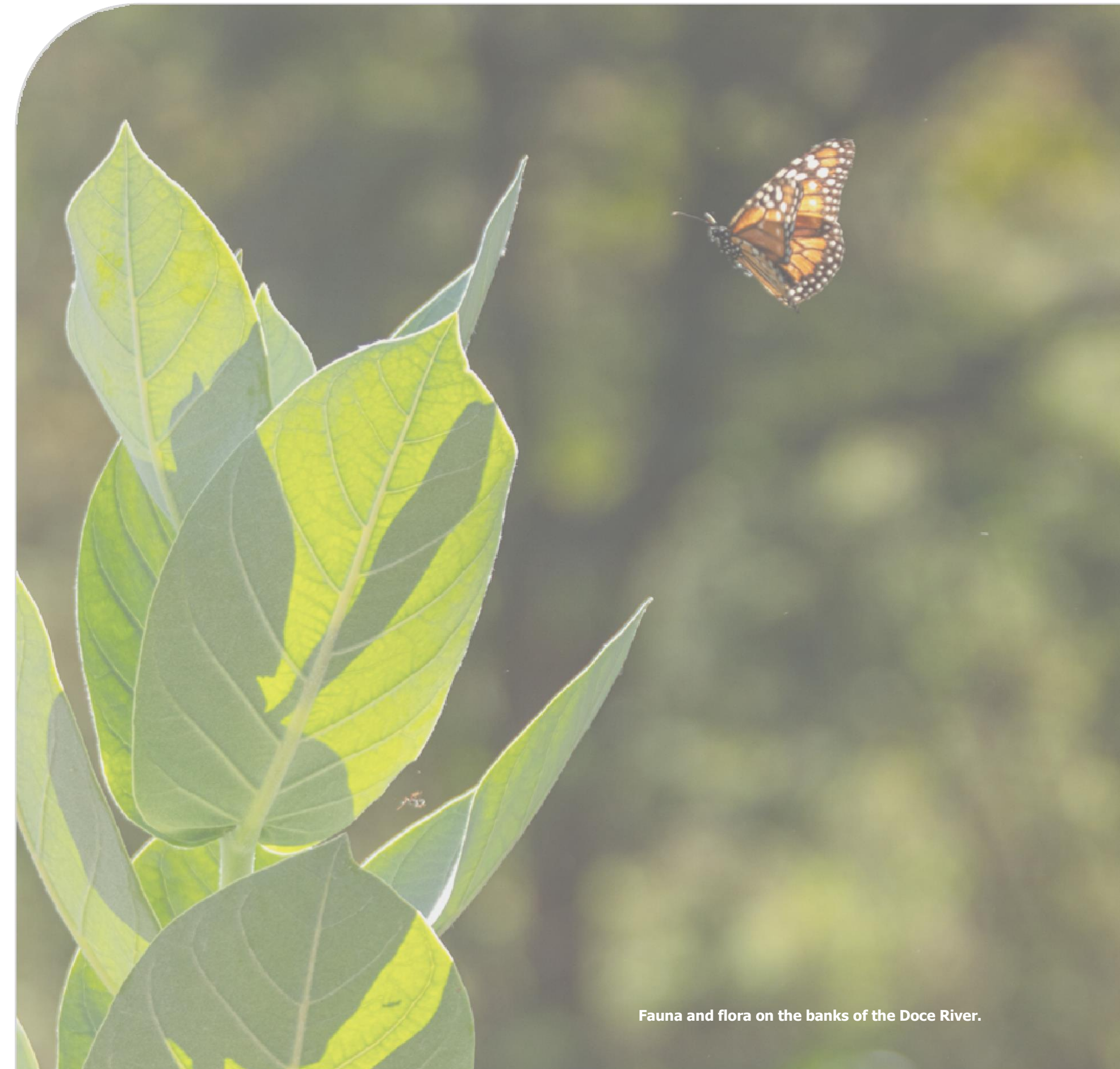
Fauna and flora on the banks of the Doce River.