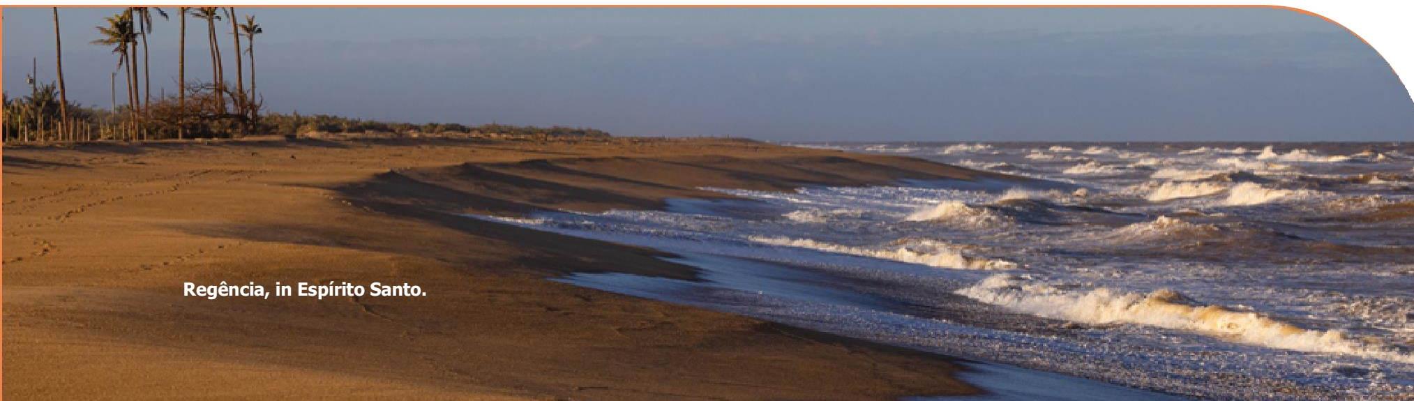
Regência, in Espírito Santo.

The health and safety of employees is a priority. If you are in a situation where an undue advantage is accepted or granted as a result of an imminent direct or associated threat to health or safety, preserve your physical and mental integrity and report the incident to your leadership and the Compliance department immediately.