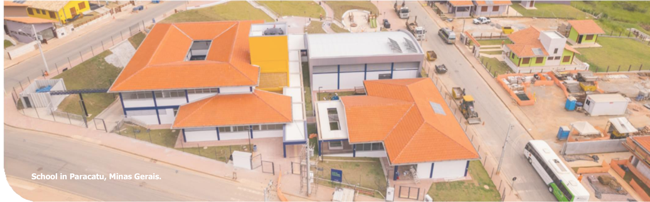
School in Paracatu, Minas Gerais.

A conflict of interest arises when the position of an employee — their considerations, financial or personal interests — may affect or has the potential to affect their criteria, objectivity or independence in decision-making during the conduct of their activities at the Renova Foundation . All employees have the duty to conduct their activities with impartiality and professionalism. If any relationship is identified that could give rise to a conflict of interest, report it immediately to your leadership and to Compliance, by completing the Declaration of Relationships.