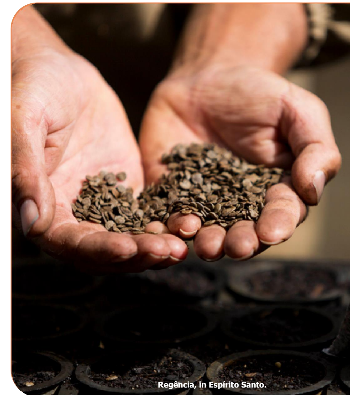
Regência, in Espírito Santo.

To the extent permitted by law, the Renova Foundation reserves the right to monitor and investigate the use of its mobility devices, information systems and to access electronic communications or information stored in systems, devices or equipment for maintenance, institutional needs or to meet a legal or regulatory requirement of some policy.